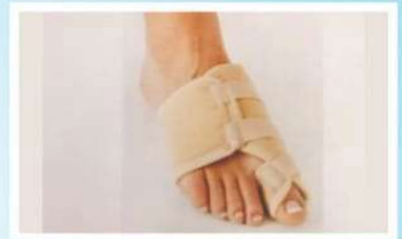
BRACES & SUPPORTIVE DEVICES BIG TOE IMMOBILIZER

Prathap Kumar Prosthetist & Orthotist 95000 24639