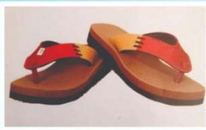
MCR / MCP FEMALE PREVENTIVE FOOTWEAR