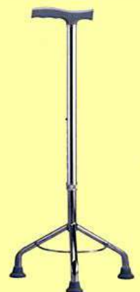
Tripod Adjustable Walking Stick (Aluminium)