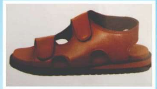
MID FOOT ULCER OFFLOAD

This mid Foot Ulcer offload Footware Primarily Aims to Offload Midfoot Regions at high Ulcer risk.