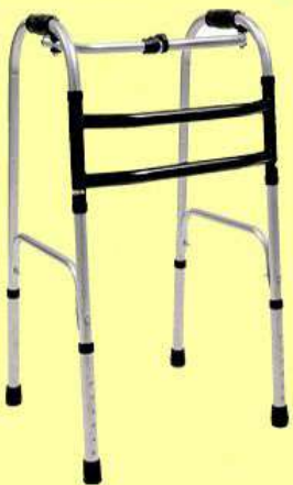
Foldable Walker (Aluminum)