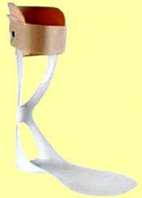
Foot Drop Splint